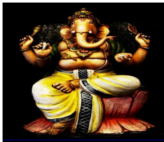
Idol of Hindu elephant god Ganesha is a yoga god, frequently depicted in yoga postures (asanas) described as "always situated in the muladhara"(the lotus)

HATHA YOGA teaches that there are some 72,000 invisible psychic channels, which constitute another-dimensional body. This "subtle" body is claimed to connect to the real body in seven predominant places, ranging from the base of the spine to the top of the head. Yoga also teaches that at the base of the spine lies coiled a great serpent power called, in Sanskrit, 'kundalini shakti'.