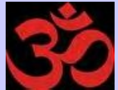
Hindu Symbol OUM ! The OM Symbol / Mantra (Chant) is associated with Hinduism’s 330 million gods !